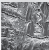
The bearing is scuffed after using a leading synthetic motor oil.